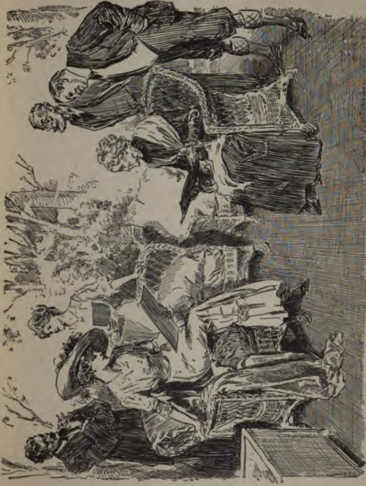
“It is very beautiful, Louis,” said his mother, with a smile of pride.”